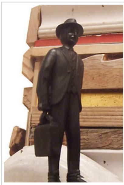
Luis Garcia-Nerey, Babylon (detail), Courtesy Carol Jazzar Contemporary Art

Sadly, what begins as a utopia often ends in one hot mess. Such was the case with ancient Mesopotamia's capital city of Babylon — its cultural, intellectual, and political hub and the location of the Hanging Gardens (one of the Seven Wonders of the World). Besieged by invasions and inner turmoil, the model city eventually faded away. Drawing inspiration from the lost metropolis, Miami-based artist Luis Garcia-Nerey has constructed an elaborate installation of towers made from found objects and recycled wood — a mini-civilization populated by ominous, briefcase-toting statuettes. Garcia-Nerey's little world is completely engrossing, leaving viewers to seriously ponder issues of urban growth and history.